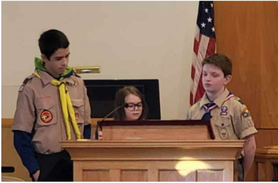
Scouts present during Scout Sunday