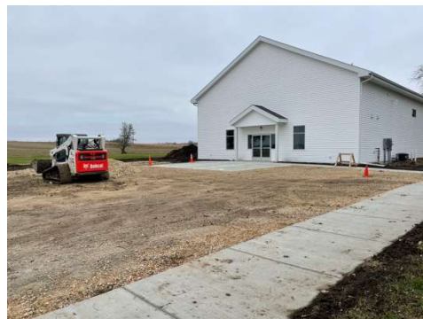
Gravel, handicap parking, and sidewalk installed.