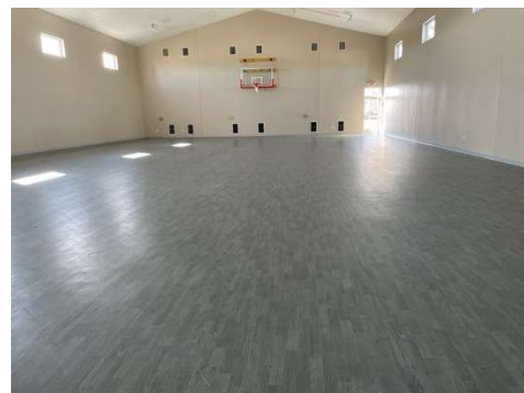
Sports Tech Flooring installed, March 4-7. Lines just painted!