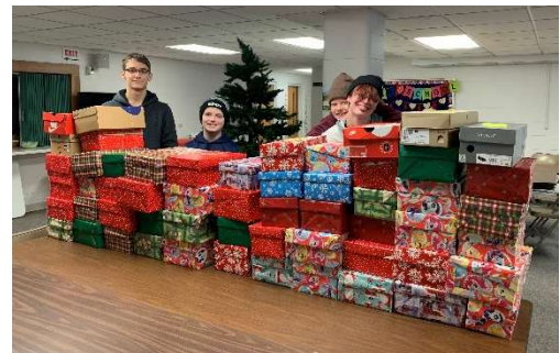
Youth pose behind a stack of packed Operation Christmas Child Boxes.