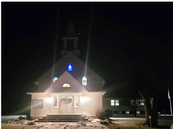
The church illuminated on Christmas Eve.