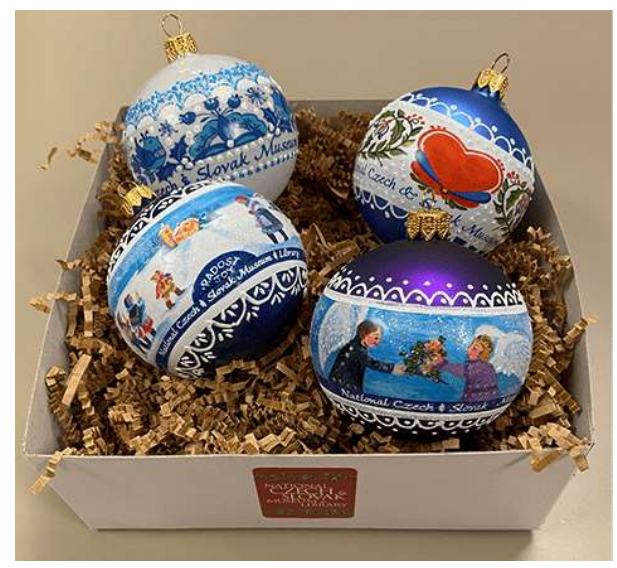
Decorated ornaments by Marj Nejdl.

The exhibit features examples of Nejdl's folk art including decorated eggs, a quirky birdhouse, aprons, book illustrations, paintings and Christmas ornaments.