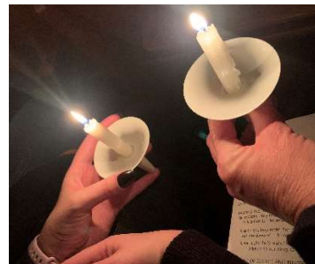
Candle light is passed during the Christmas Eve candlelight service.