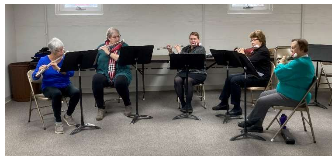
A flute choir performs during fellowship.