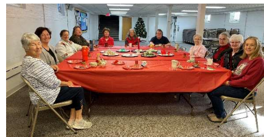
Ladies of the church enjoy a Christmas tea on Dec. 20.

Dementia Friendly America (DFA) is a national network of communities, organizations and individuals seeking to ensure that communities across the U.S. are equipped to support people living with dementia and their caregivers. Dementia Friendly Iowa is the initiative at the state level helping launch individual dementia friendly communities across the state. A dementia friendly community is a village, town, city or county that is informed, safe and respectful of individuals with the disease, their families and caregivers and provides supportive options that foster quality of life. Becoming a recognized Dementia Friendly Community means a community is engaging in a process to become more dementia friendly.