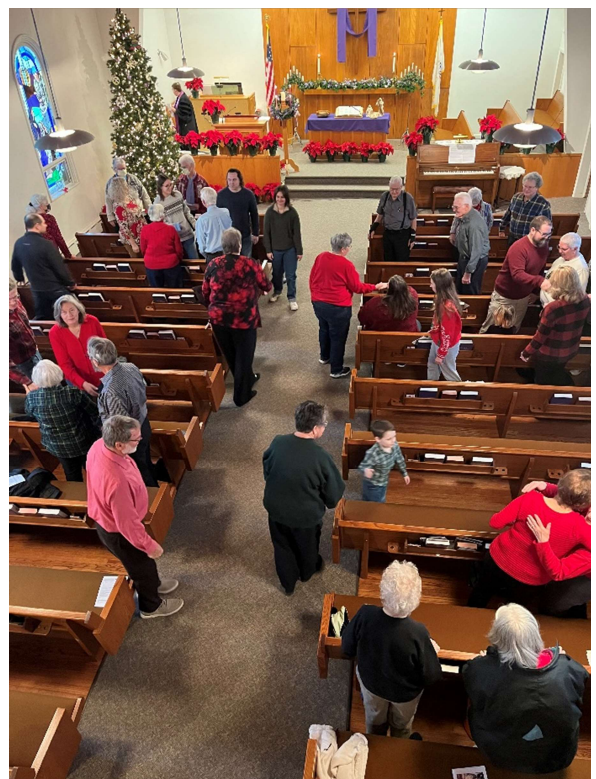
Congregation Members pass peace during December 24 morning service.