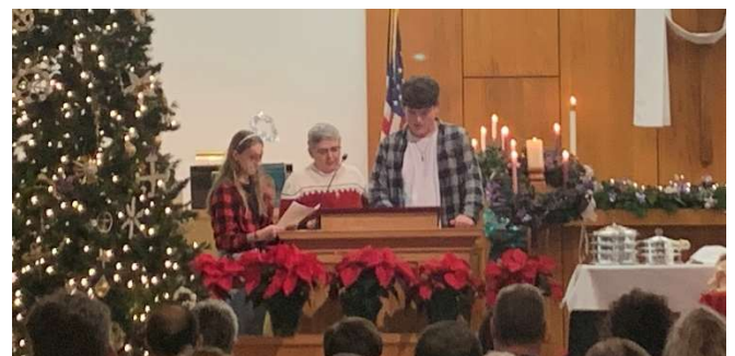
The Serbouseks share a reading on Christmas Eve.