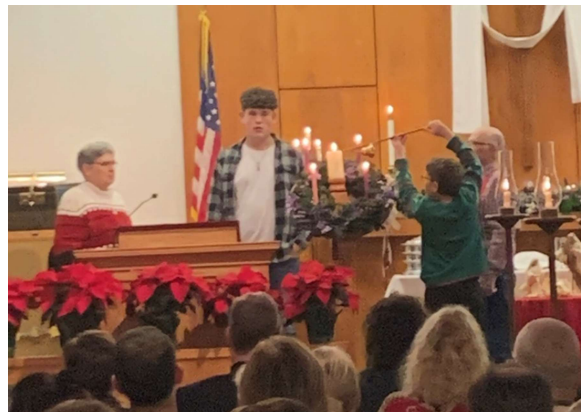
The Serbouseks light the advent wreath on Christmas Eve.