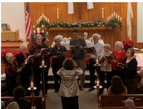
The choir performs during Christmas Eve Worship.

NON-PROFIT ORGANIZATION U.S. Postage Paid Ely, Iowa 52227 Permit #1