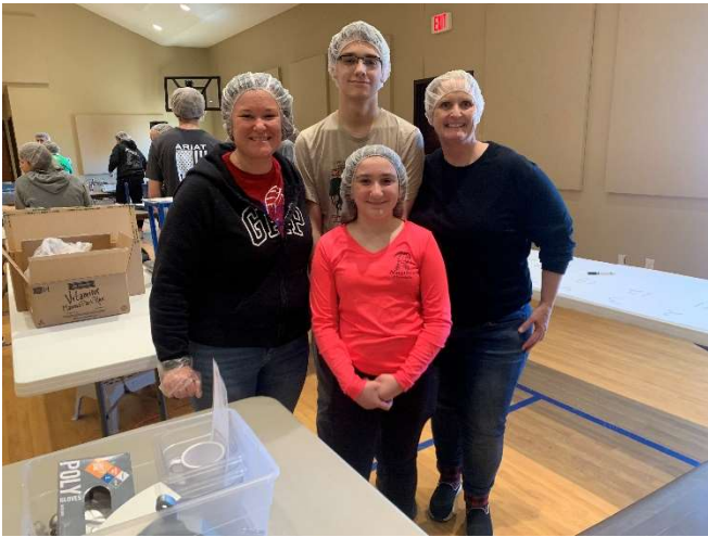
Volunteers pose while working at Feed My Starving Children