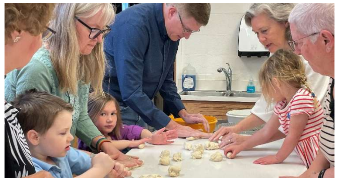
Church members make pretzels during Sunday School.

10:30 a.m. Sunday School/Youth Group TBA