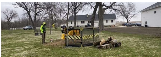
Workers remove stumps on the church grounds.

Thank you for a successful and productive spring clean up!