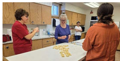
Bakers prepare kolaches for the building dedication.