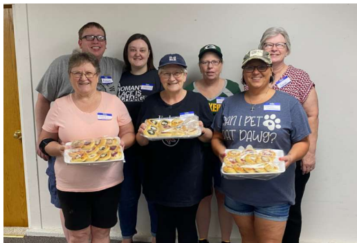
Kolache Kamp participants pose with their completed kolaches.

If you don't want to camp out, come for Saturday evening. 6:00 p.m.